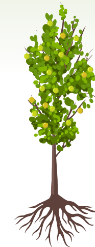
EARLY FRUIT DEVELOPMENT